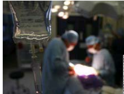
Foreign objects are left inside a patient in one out of every 10,000 surgeries, an earlier study found.